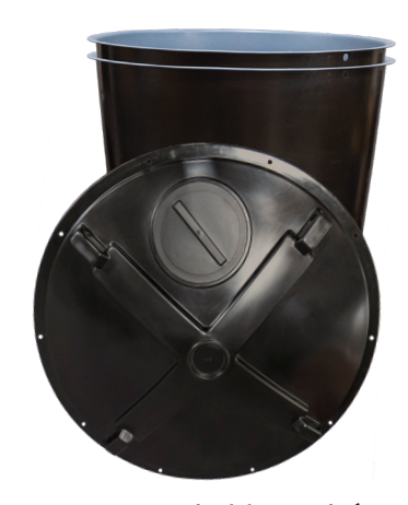
Open Top Stackable Tank (TST)