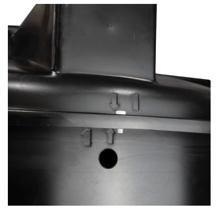
Align molded directional arrows to easily install tank lid using the nylon screws provided