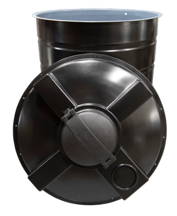
Open Top Tank (TOT)