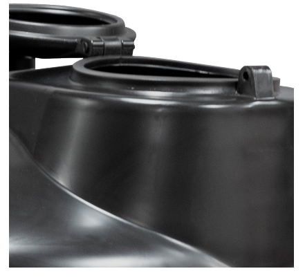
Lockable access lid for added safety