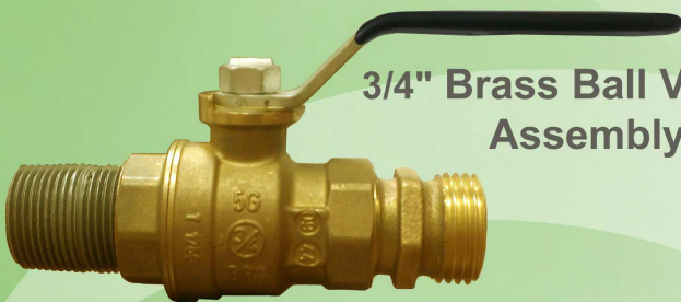
3/4" Brass Ball Valve Assembly