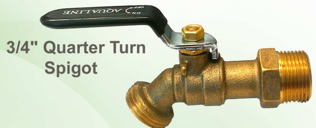
3/4" Quarter Turn Spigot