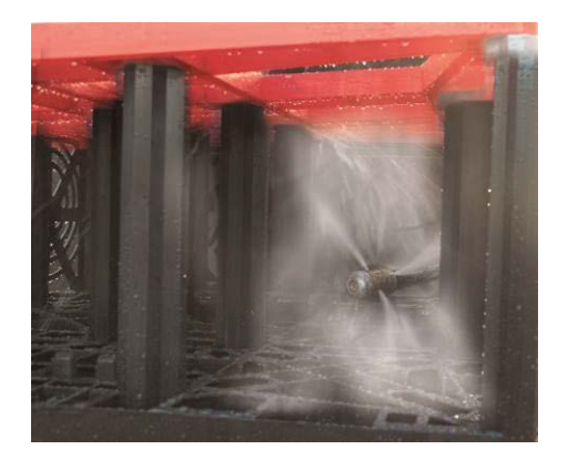
Jet washing the system

Regularly checking the infiltration/attenuation system will ensure high performance and guarantee the rapid distribution of surface & rainwater in the event of heavy rainfall of a high intensity.