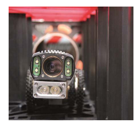
Inspection with camera