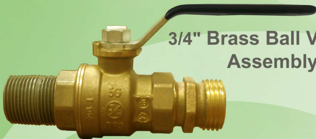
3/4" Brass Ball Valve Assembly