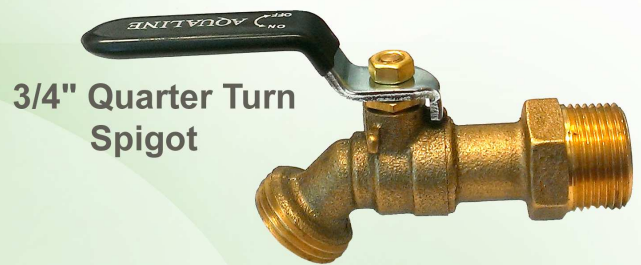
3/4" Quarter Turn Spigot