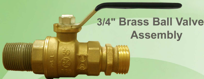
3/4" Brass Ball Valve Assembly