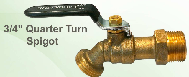
3/4" Quarter Turn Spigot